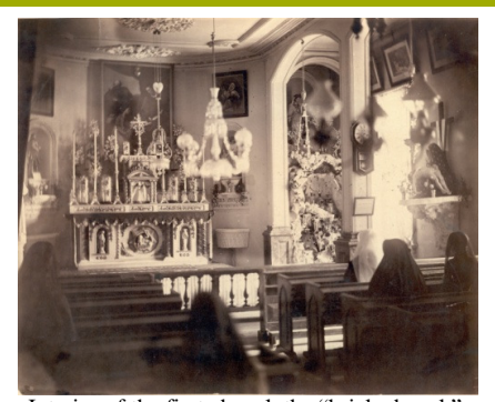
Interior of the first chapel, the "brick chapel," between 1867 and 1888. To our knowledge, there is no photo of the exterior of this chapel.

In October 1864, the arrival of the sisters from the former motherhouse in Saint-Jacques and the constantly growing number of students at the boarding school meant building a chapel big enough to hold everyone. In 1866, a chapel was built behind the Manor. It had no foundation, was made of brick and was two stories high with a back gallery. Completed in 1870, it was used for worship until 1888, at which time it was torn down, along with the Manor, to make room for the wing with the Sanctuary of Saint Anne, today the central section of the Convent complex, which extends outward toward Saint-Joseph Boulevard.