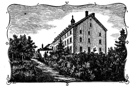
Villa-Anna Boarding school, before 1888, engraving

Please walk east on Saint-Joseph Boulevard until you reach 12th Avenue. Cross the street and go west on Saint-Joseph Boulevard, up to the College property fence, and then stop. From this vantage point, you can see the first building in the Convent complex: the Villa-Anna boarding school.