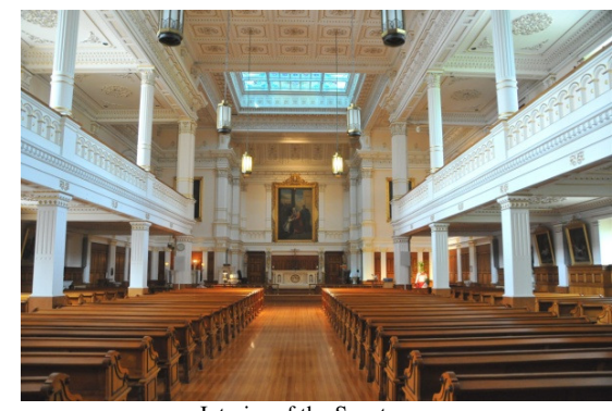
Interior of the Sanctuary