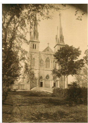
The first church on the present site was built between 1863 and 1865.